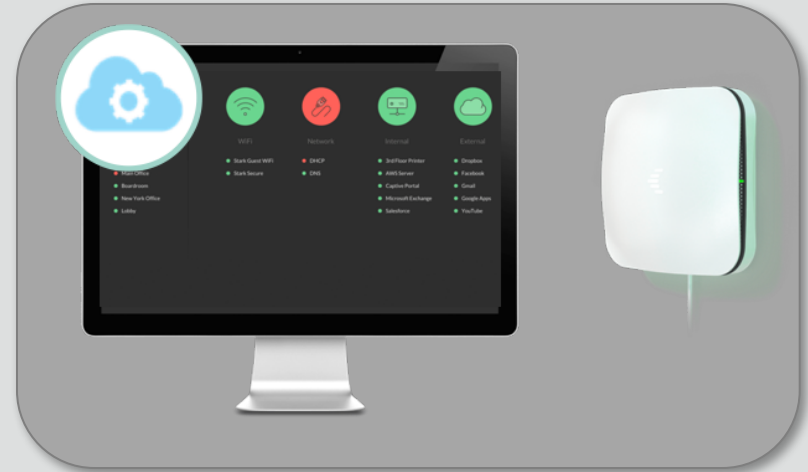
Cape Networks User-centric Service Assurance **