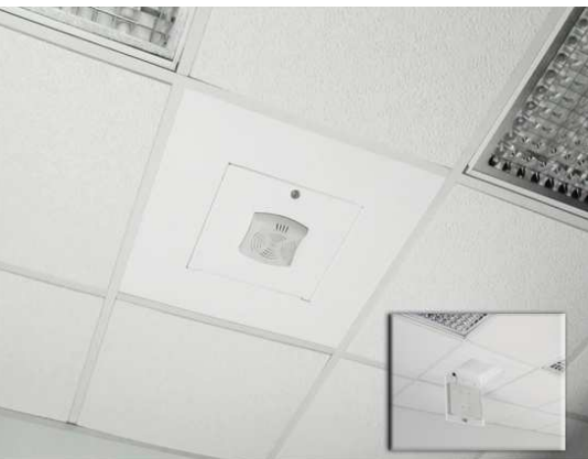
Suspended ceiling enclosures for wireless access points with detachable antennas. Interchangeable doors on enclosure permit easy upgrades to new APs and antennas.