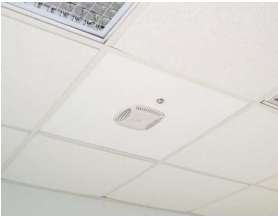
Secure, Convenient, Aesthetic suspended ceiling enclosures and mounts for wireless access points with non-detachable antennas or body integrated antennas