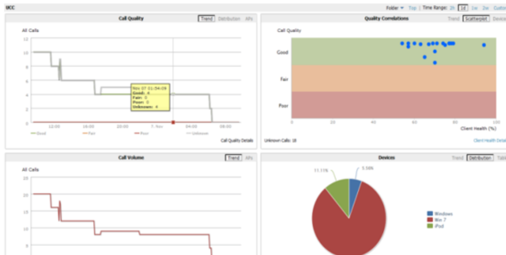
Figure 3: UCC Dashboard Example